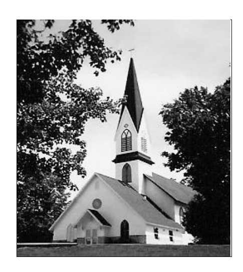
The mission of Redeemer Lutheran Church is to care for all people through the proclamation of the Gospel, celebration of the sacraments, and service to our neighbor.

Redeemer Lutheran Church W18205 College Avenue P.O. Box 220 Wittenberg, WI 54499 (715) 253-2590 redeemerwitt@gmail.com redeemerlutheranwittenberg.weebly.com www.facebook.com/Redeemer.Lutheran.568