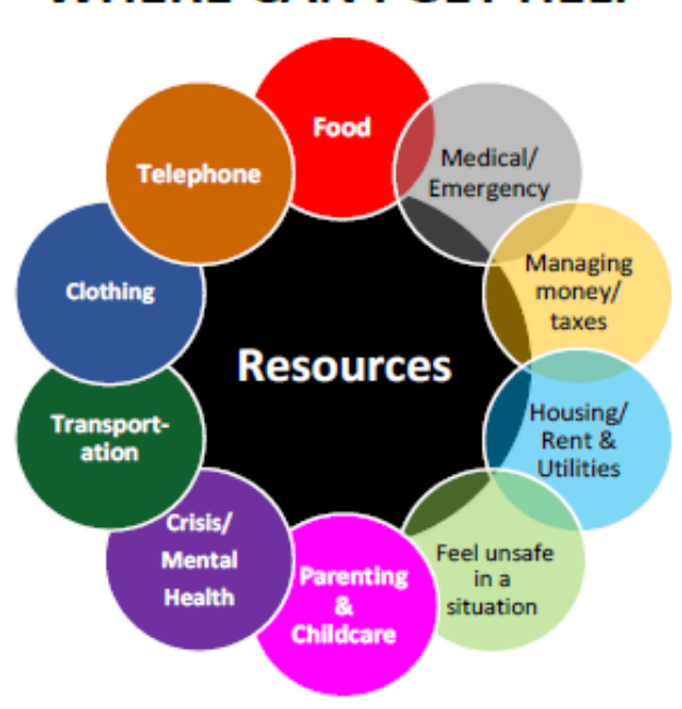
Shawano & Menominee County Resources