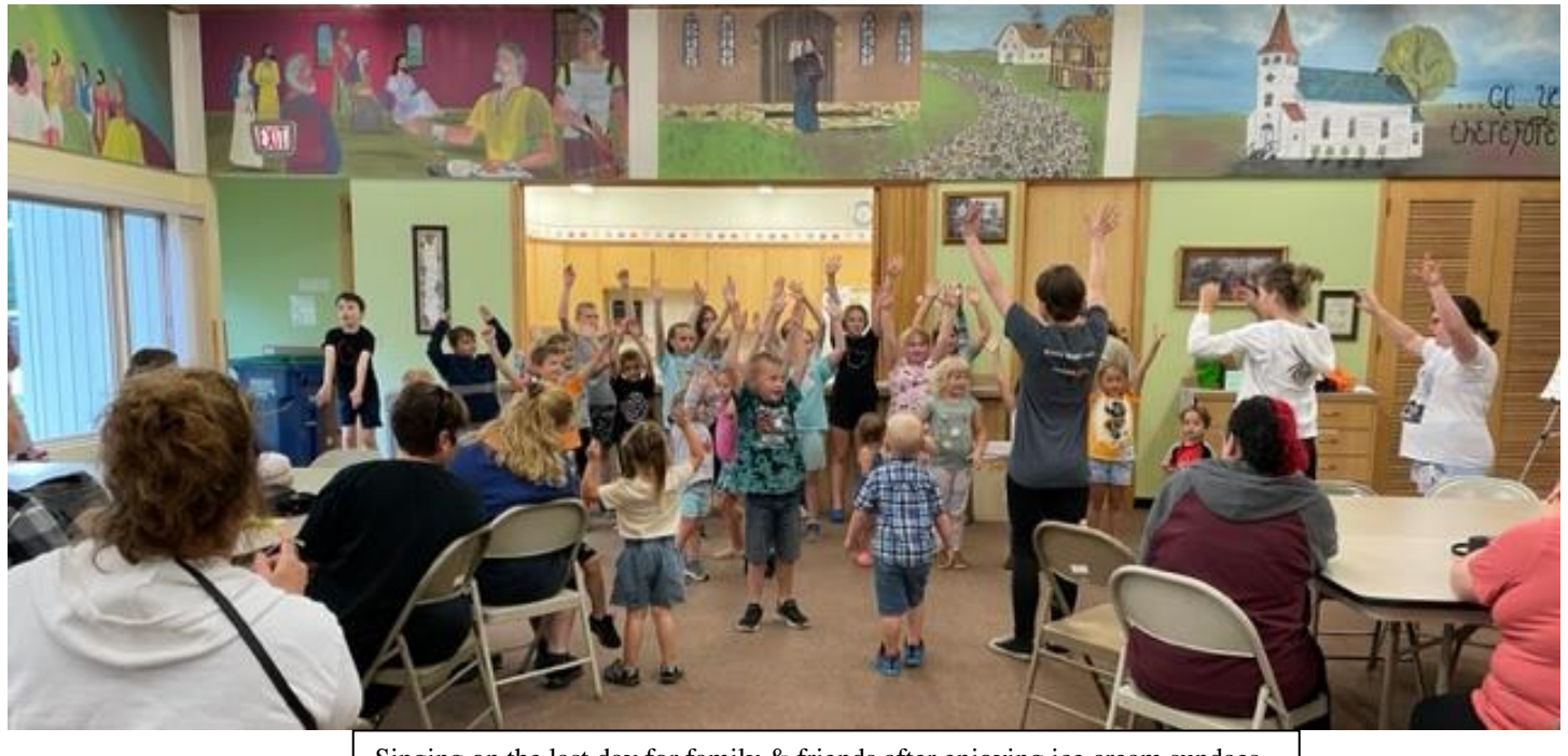
Singing on the last day for family & friends after enjoying ice cream sundaes.